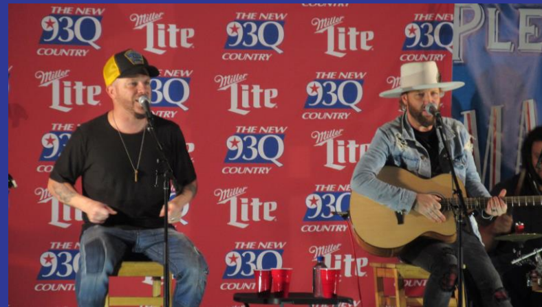
LoCash performing in Galveston