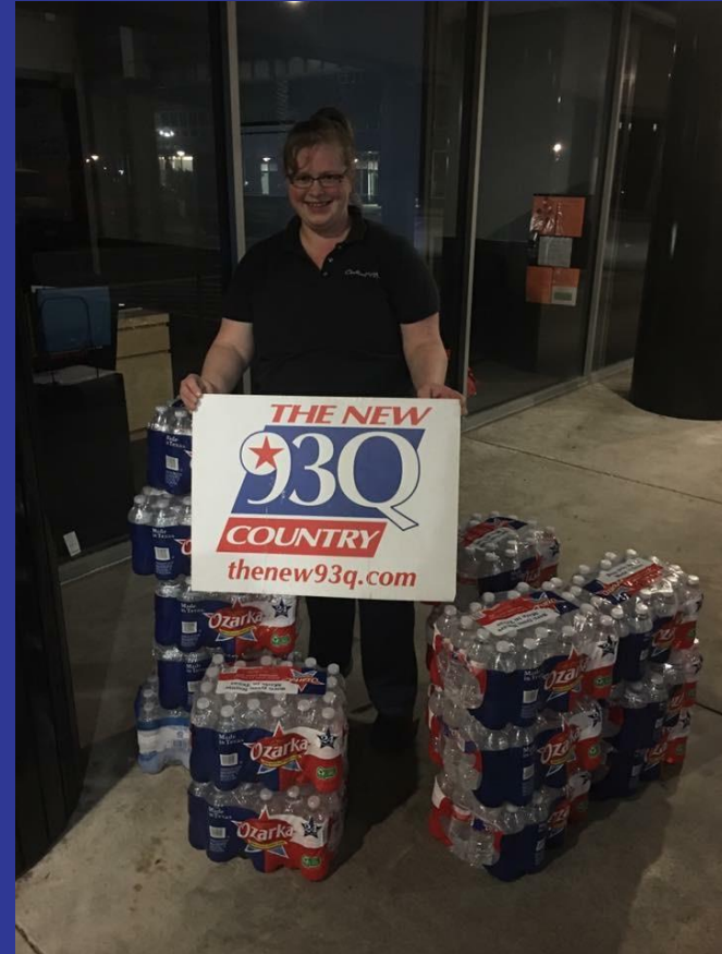
Volunteers worked tirelessly alongside The New 93Q to deliver food supplies to victims.