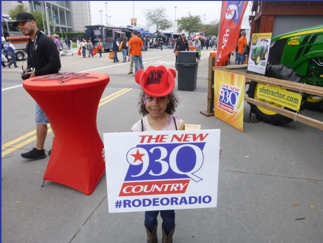
The New 93Q welcomed Rodeo-goers with giveaways, photo opportunities with their favorite talent, and fun game of corn hole.