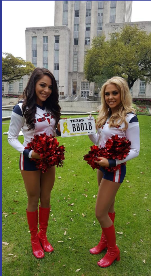
Texans Cheerleaders holding the only license plate in TX designated for childhood cancer. Snowdrop Foundation was successful in getting this passed by the legislature.