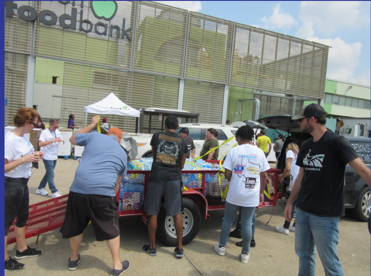
The New 93Q team helps unload and sort donations at Houston Food Bank.