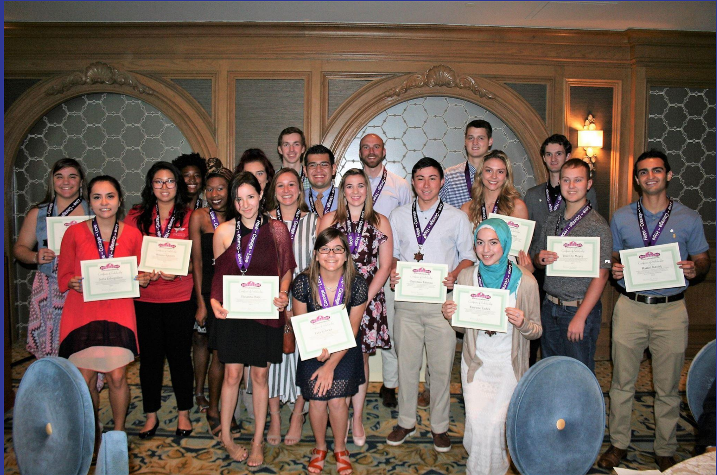
In addition to the research dollars, 2017 saw Snowdrop Foundation award $221,000 in college scholarships to 75 pediatric cancer survivors.