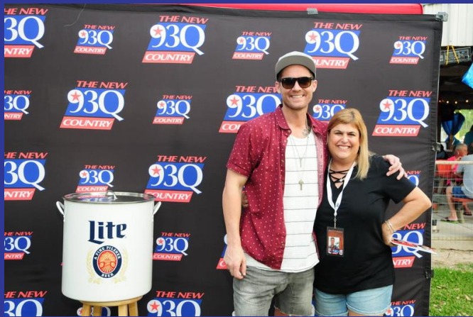
Brett Young with a loyal 93Q listener

For these private performances, we invite 25 to 30 listeners, winners of these coveted slots through on air contesting. The featured artist plays live, answers audience questions and provides photos and autographs to the grateful fans in attendance