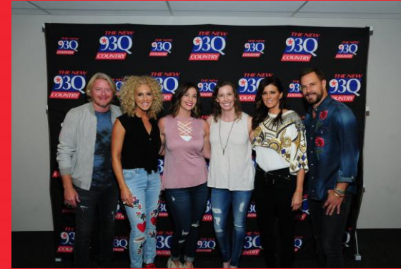
Little Big Town with 93Q fans